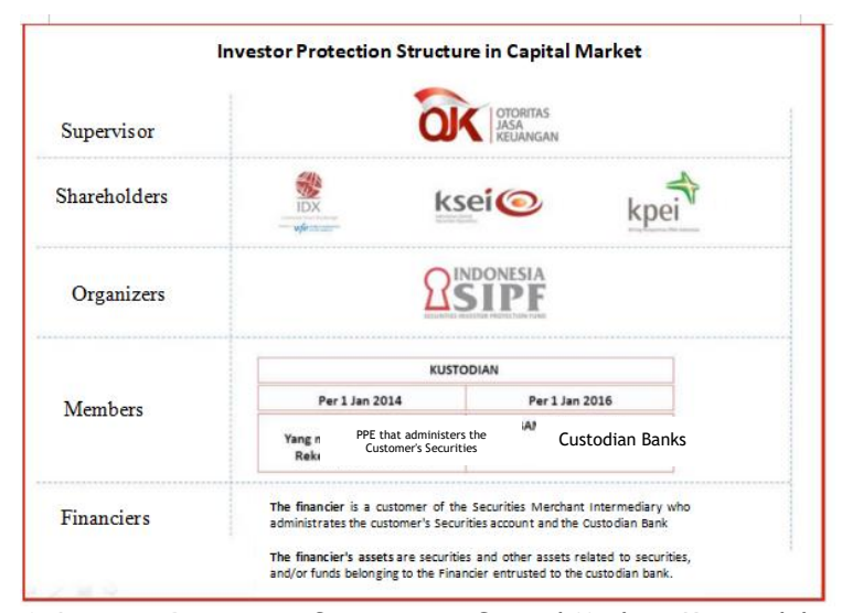
Figure 1. Investor Protection Structure in Capital Market (Komandoko, 2020)

This includes the Investor Protection fund which aims to provide compensation to investors for the loss of investors' assets in the form of securities or funds deposited with the Custodian, as a party providing securities custody services and other assets related to securities. Protection for investors is also regulated in Consumer Protection in the Capital Market Sector according to Financial Services Authority Regulation Number 1/POJK.07/2013 concerning Consumer Protection in the Financial Services Sector.