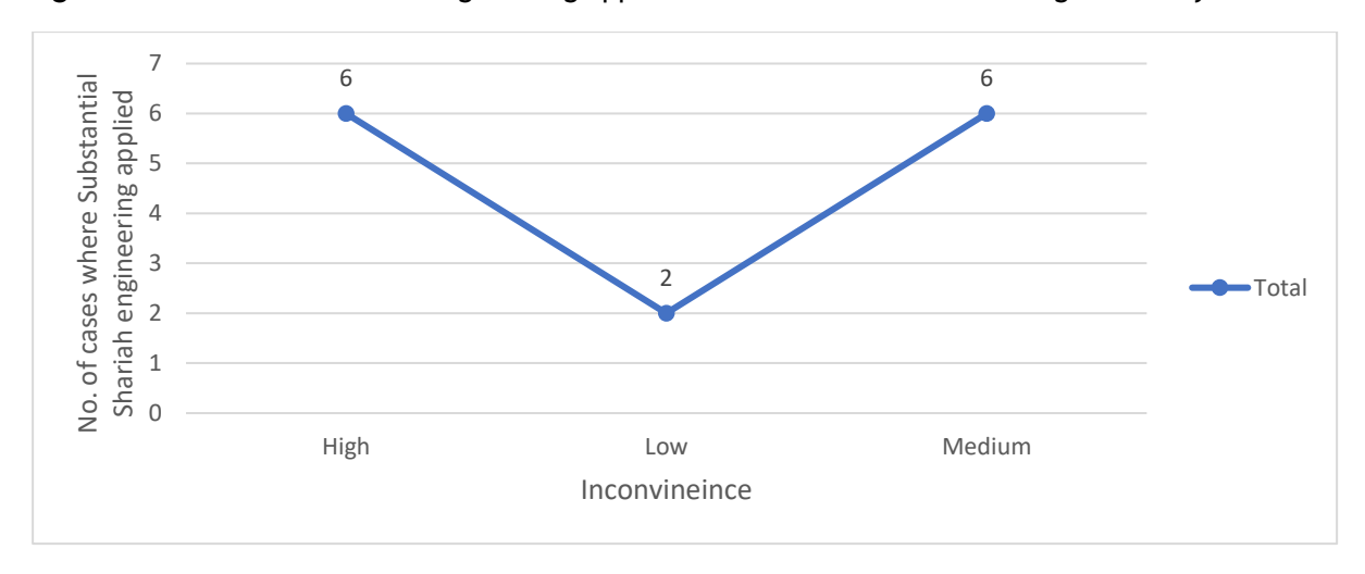
Figure 2: Maqasid-e-Shari'ah maintained while changing the essence of the contract