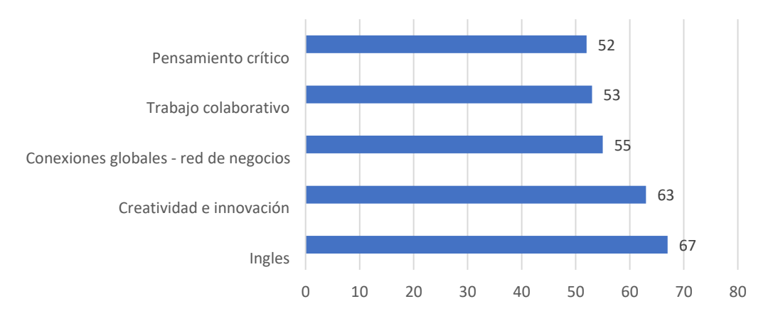
Figure 1. Perception of first group of Skills