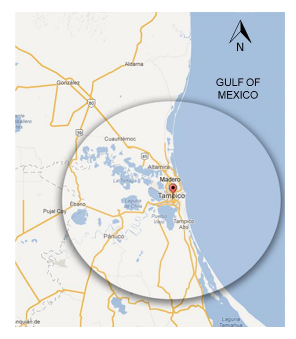
Map 2. Radius of action of a Film Commission in the MAT

On the other hand, it must be said that it is important that the people involved in the shootings -the production team, actors, stage managers, etc.- be able to return to the city since this entails hotel nights, consumables and miscellaneous expenses that will remain in the city. A reasonable time for a production team to move to a location and then return to sleep in Tampico the same day (short transfer time) is 45 minutes - the distance is about 50 kilometers. With this in mind, the following map was created with the radius of action of a Film Commission in the MAT (Map 2).