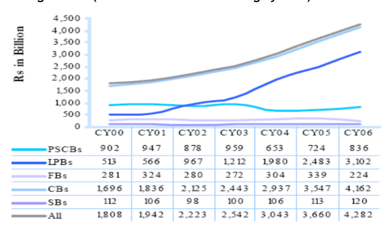
Figure: 03 (Total Assets of the Banking System)

Exact examinations have offered help from the hypothetical point of view of the job of social capital in advancing pioneering achievement. The unmistakable examination has shown that businesspeople's areas of strength with networks are bound to approach significant assets that can assist them with succeeding.