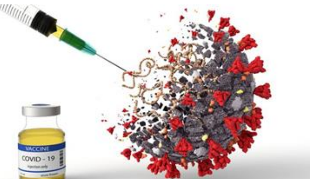
Figure 1. Covid-19 Vaccine

The ultimate aim of every vaccine is to spur the human body's immune system to combat the antigen. If re-infected, this will trigger a stronger immune response. The COVID-19 vaccine's prime objective is to curb the spread of the virus, as well as lower the incidence and fatality rate of COVID-19. By accomplishing herd immunity and safeguarding the public from the virus, social and economic productivity can be sustained.